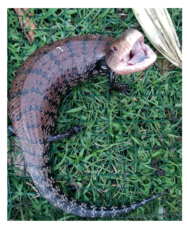
Fig. 4. Defensive posture of Tiliqua gigas from Northern Sulawesi, Indonesia. Note the blueish tongue stretched out towards potential predators.

Sulawesi site. This gap implies a crossing of the biogeographically important Weber Line running east of Sulawesi and separating the Oriental and Oceanian faunas (Weber 1902; Lohman et al. 2011; Holt et al. 2013; Vilhena & Antonelli 2015).