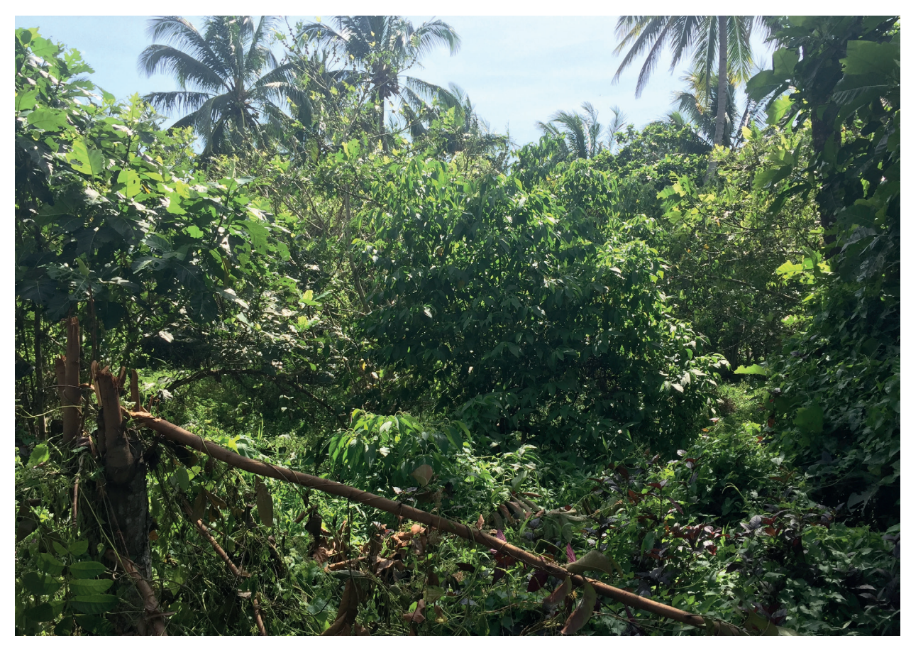
Fig. 3. Habitat in which Tiliqua gigas was found in Northern Sulawesi.