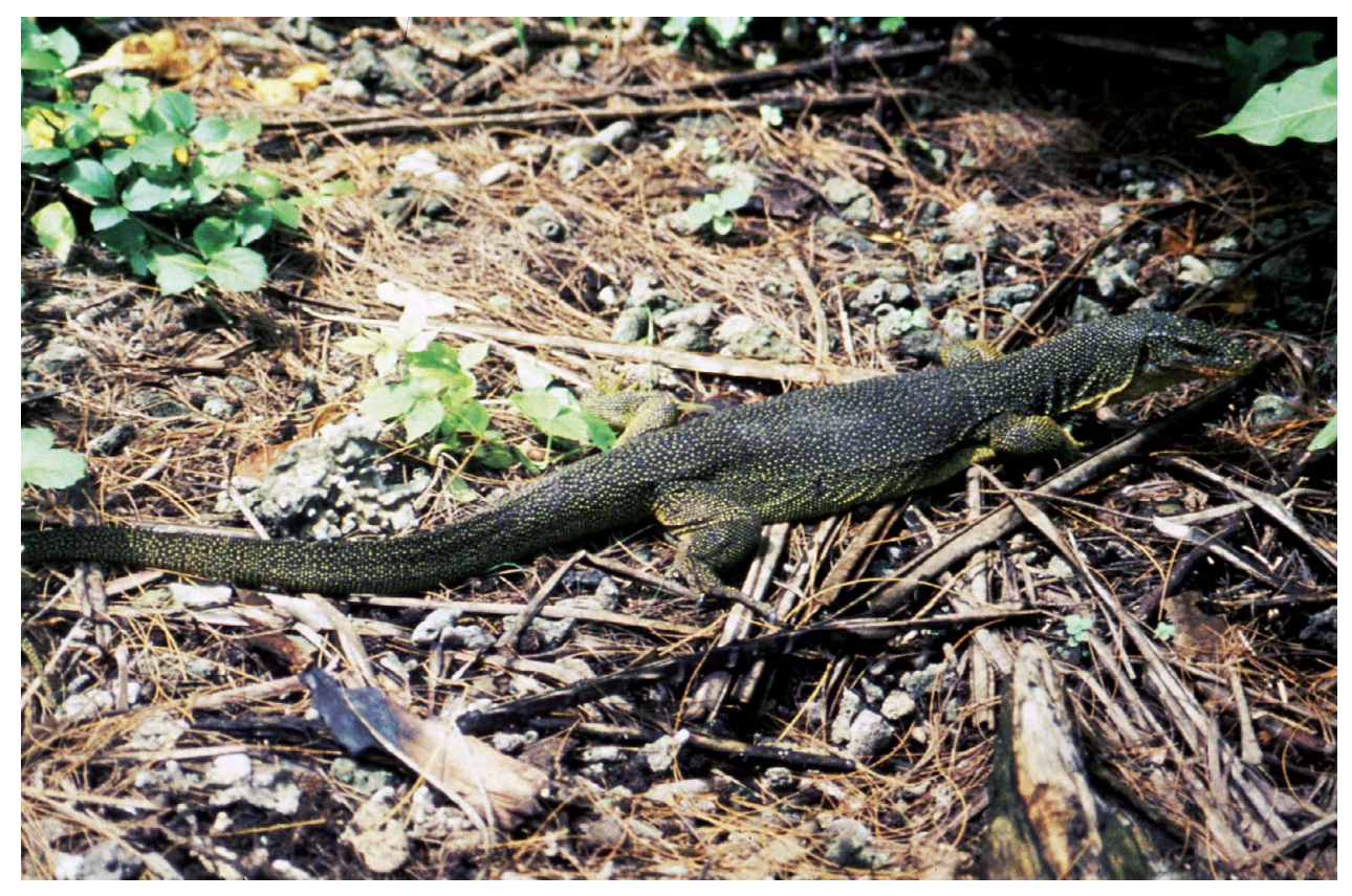
Fig. 4. Free-ranging specimen of Varanus indicus on Enu Id., Aru Archipelago, Indonesia.

because it is a morphologically (both external and genital) and geographically definable unit and represents also a conservation unit of its own.