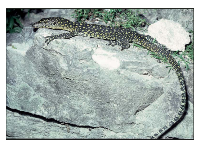
Fig. 2. Living juvenile specimen of Varanus colei sp. nov. from Kei Besar Id., Kei Archipelago (WAM 109763).

Variation. The morphological description of the Kei Islands monitor population is so far based on the holotype and the 10 paratypes listed above (see Table 1). The five scalation characters selected (Brandenburg's characters Q, S, X, XY, and m) are those which proved already to