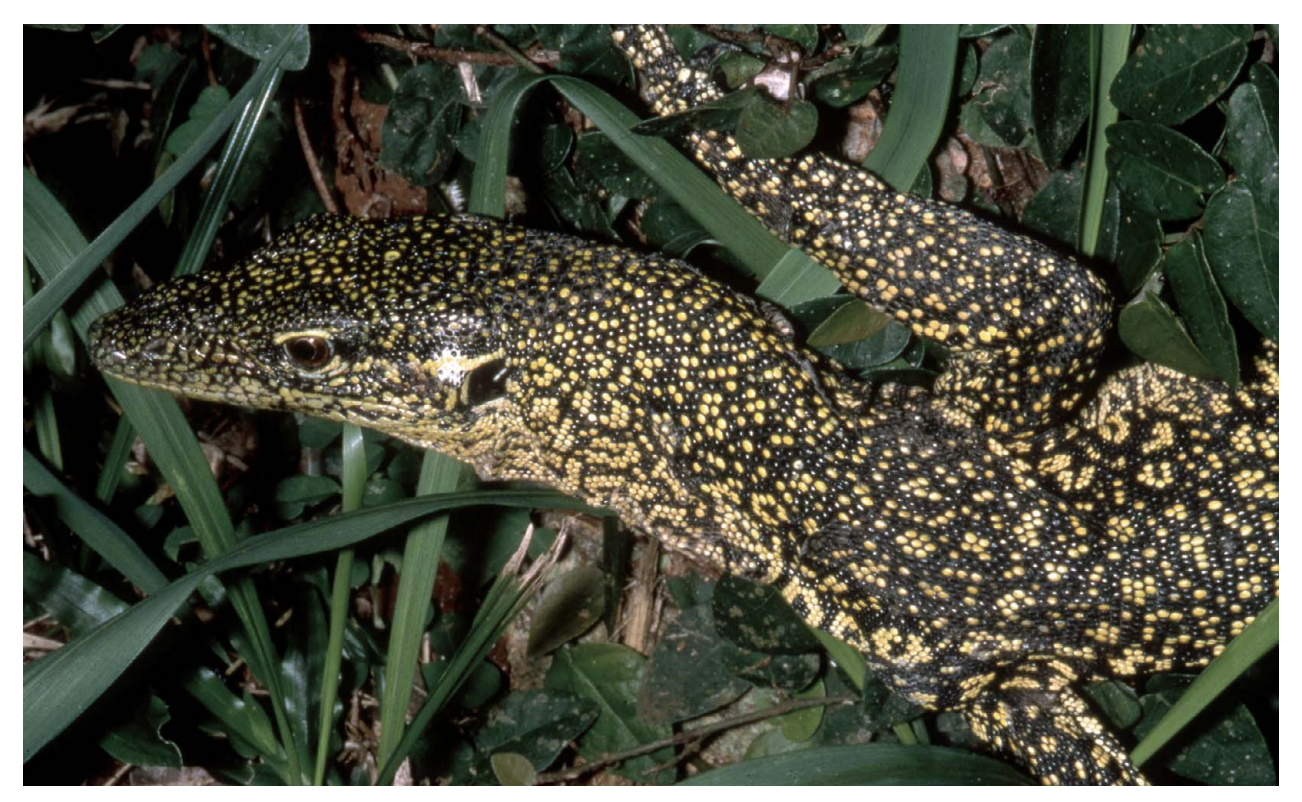
Fig. 5. Varanus sp. (cf. indicus) from Tanimbar, easternmost Sunda Ids., Indonesia.

ther the species or the subspecies level, e.g., the gekkonids Lepidodactylus pantai, Nactus pelagicus undulatus, the scincids Cryptoblepharus keiensis, Sphenomorphus capitolythos, S. undulatus, and Tiliqua gigas keyensis, the colubrid Dendrophis keiensis and others (Stubbs et al., 2017; Karin et al., 2018). Some of those listed now as full species were originally also first described as subspecies only. According to these authors, there are potentially more endemic species which are now still hidden under other species names. A next example in the geographical neighborhood could be found in the Tanimbar Archipelago situated southwest of the Kei Archipelago (Fig. 3). The mangrove monitor lizard population living there is also unusually patterned (Fig. 5) and suspected by Weijola et al. (2019) to be a cryptic candidate for an undescribed species. Biogeographically, this situation is paralleled by the skinks of the genus Tiliqua. T. gigas keyensis is the taxon endemic to the Kei Archipelago, while T. scincoides chimaerea is the respective endemic taxon of Tanimbar (Shea, 2000a, 2000b).